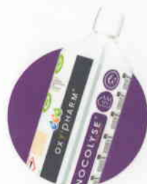
Nocolyse One Shot Disinfectant for reinforced treatments 12% hydrogen peroxide