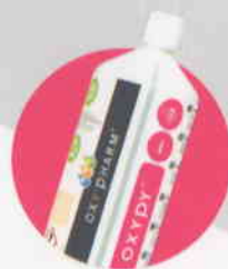
Oxypy Treatment for flying and crawling insects