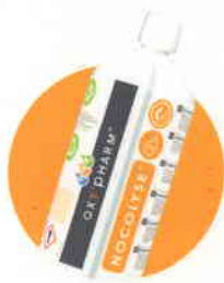
Nocolyse Disinfectant 6% hydrogen peroxide