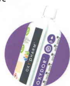
Oxydor Deodoriser. Essential oils based product