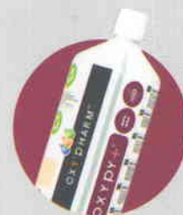
Oxypy + Specific treatment for bed bugs, larvicidal