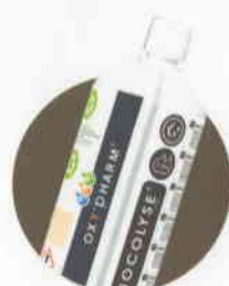
Nocolyse Food Disinfectant treatment for surfaces coming in contact with food 7.9% hydrogen peroxide