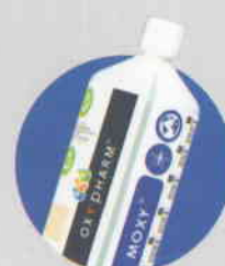
Moxy Mosquito repellent treatment