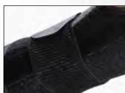
Easy to use strap