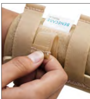
Easy to use strap