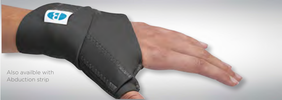
Also available with Abduction strip