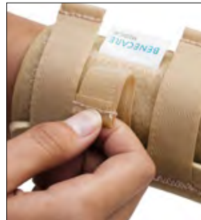
Easy to use strap