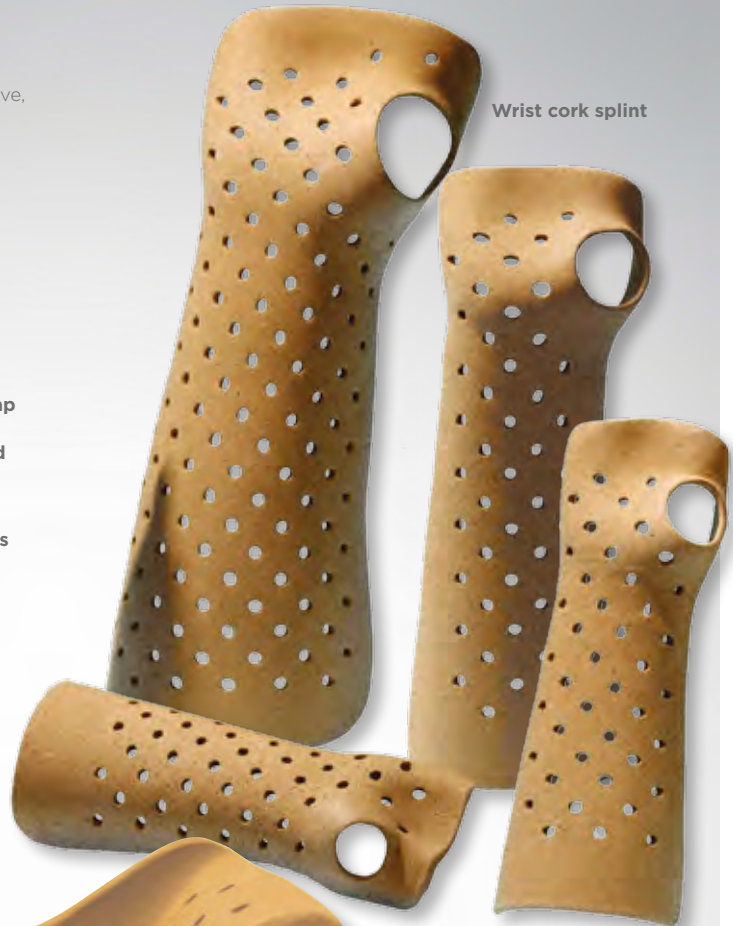
Wrist cork splint