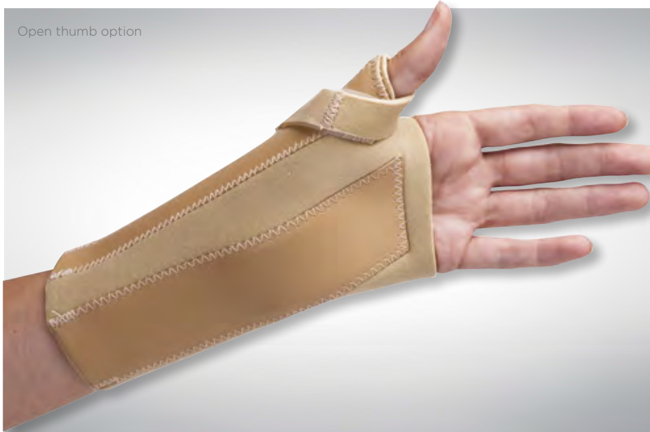
Open thumb option