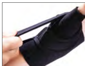
Neoprene Strap Wrap