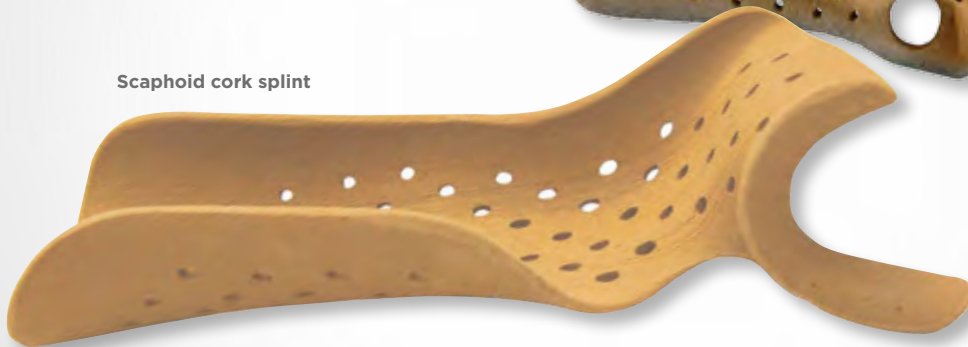
Scaphoid cork splint