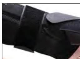
Easy to use strap