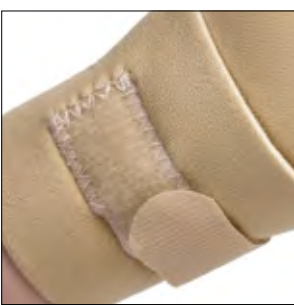
Easy to use strap