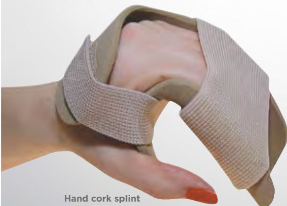
Hand cork splint