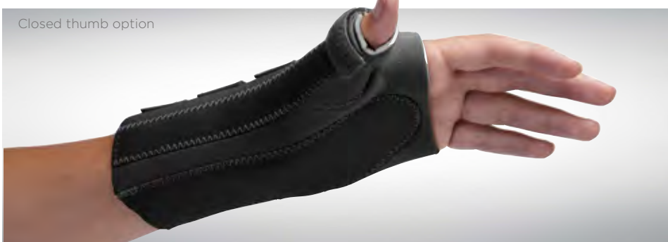
Closed thumb option